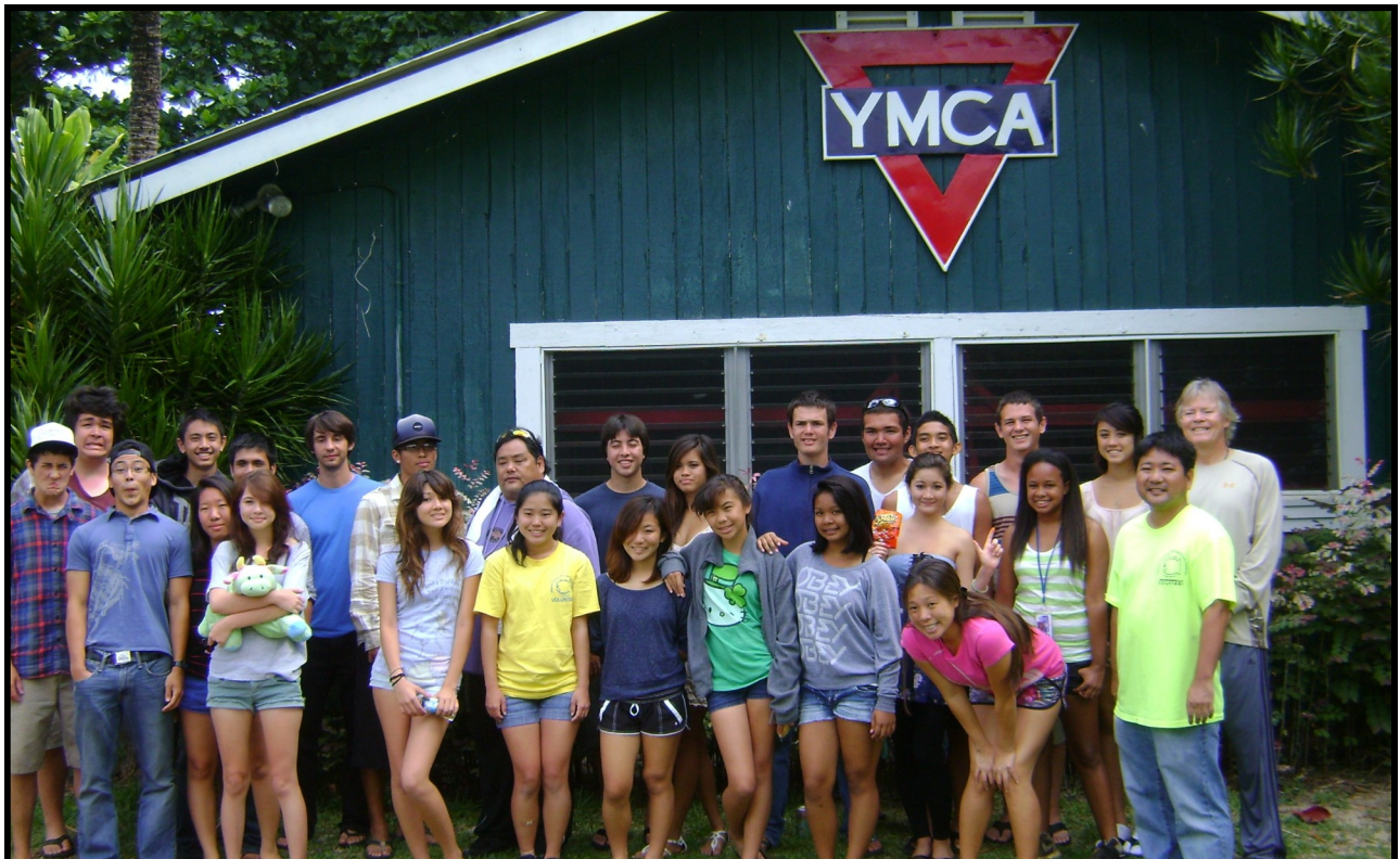
Kaua`i